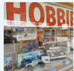
250 Sebastian Blvd # 7 772-581-4778