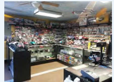
1856 SW Bayshore Blvd. 772-380-9595