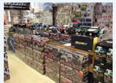
1695 W Indiantown Rd Ste 5 Jupiter, FL